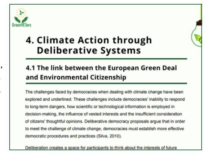
Page from the GreenVETers Handbook

The GreenVETers Handbook on the Green Deal and Citizen Deliberation aims to inform about the two topics of its title, as well as the need for their intersection. The Handbook primarily targets VET educators, in order to raise their awareness about the importance of incorporating Education for Environmental Citizenship, citizen deliberation and deliberative democracy to develop skills that will contribute to environmental sustainability. The Handbook will be made available on the project's website in English, Dutch, Portuguese, Polish and Greek.