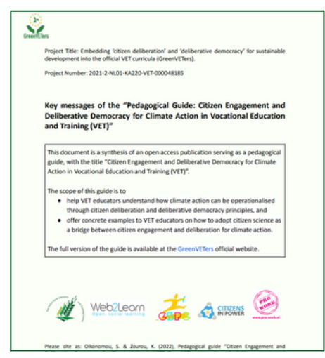
Page from the Synthesis

The creation and release of the syntheses in all partner languages, namely Greek, Portuguese, Dutch and Polish, will facilitate the dissemination of the PR2 Guide, while it is an effective way to promote our project result to national audiences.